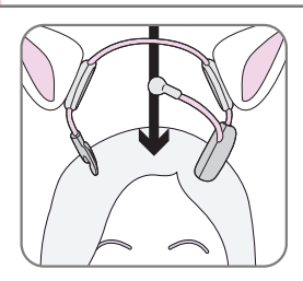
4. Place on Head